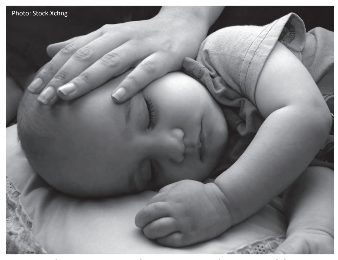
Scientists at the U.S. Environmental Protection Agency have estimated that one in 10 women of childbearing age in the United States has enough mercury in her bloodstream to risk damage to her child's brain development should she become pregnant.

Every state in the United States has issued an advisory warning against the consumption of species of fish that tend to have dangerous levels of mercury. <sup>18</sup> Every square inch of the Great Lakes is under a mercury advisory, along with thousands of smaller water bodies across the country. <sup>19</sup>